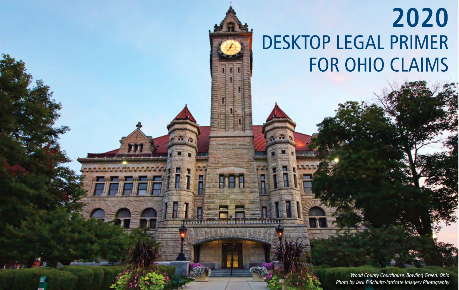
Wood County Courthouse, Bowling Green, Ohio